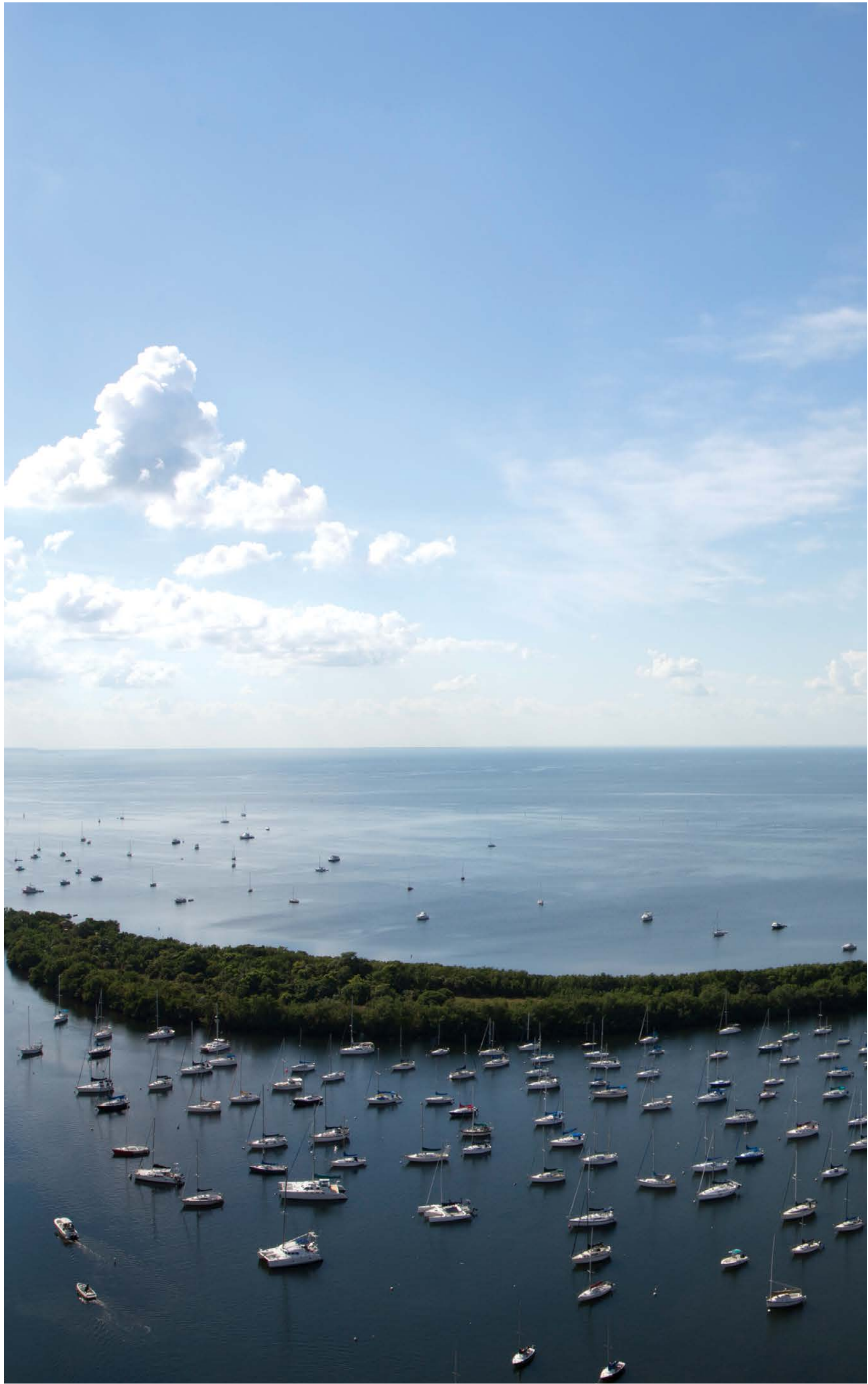
Biscayne Bay is at the heart of the Park Grove lifestyle, where life moves with the rhythm of the tides.