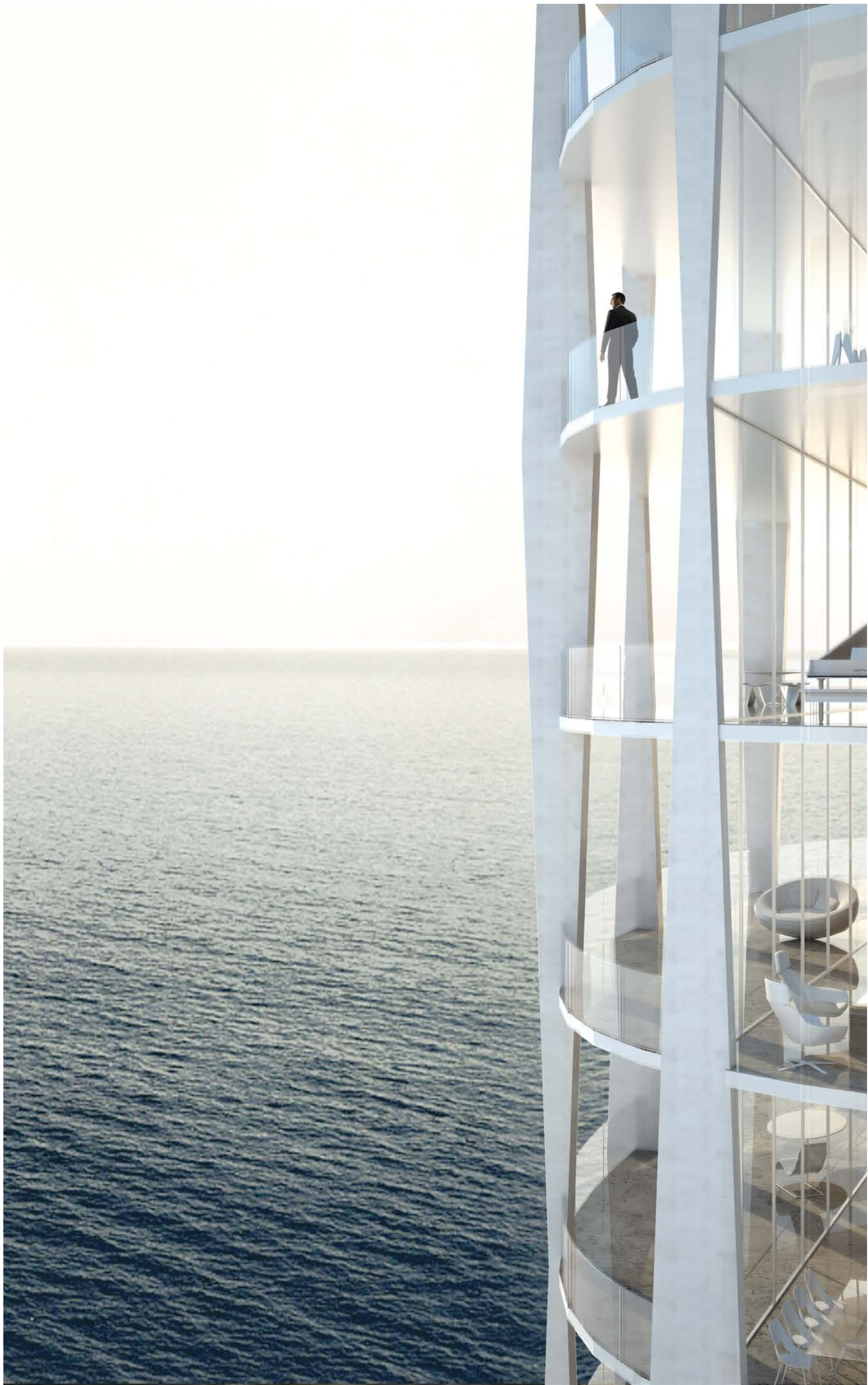
Modernist architecture meets expansive bay views.