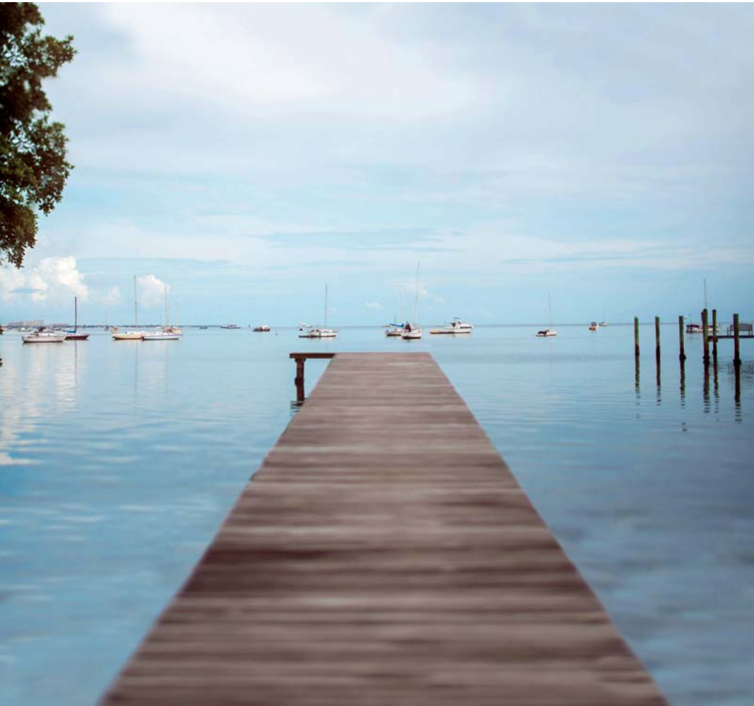
Spend an adventurous day at sea, or escape for a spontaneous evening sail.