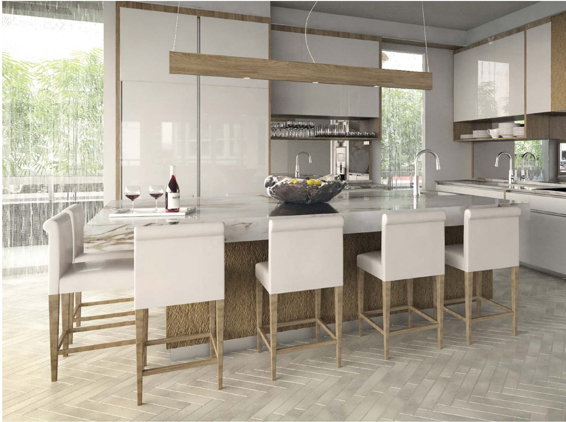
William Sofield's elegant interiors are the embodiment of everyday luxury.