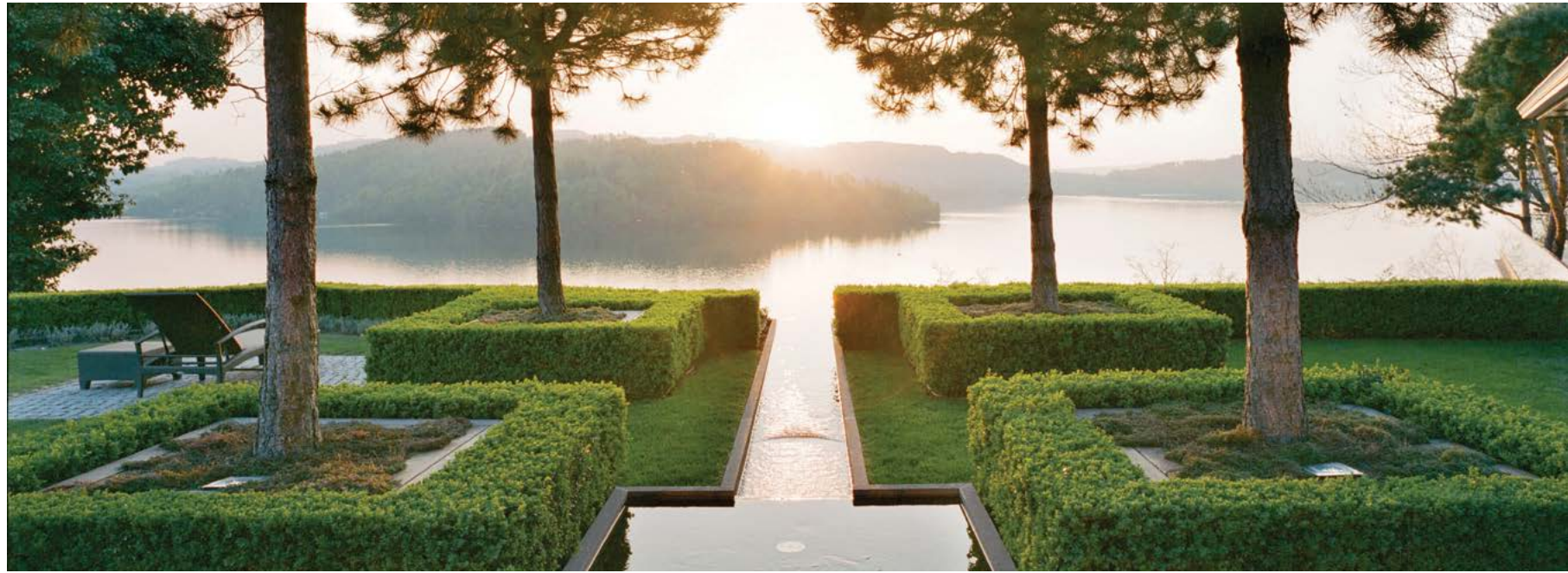
Enzo Enea's serene landscapes invite you to extend your home to the lush gardens beyond.