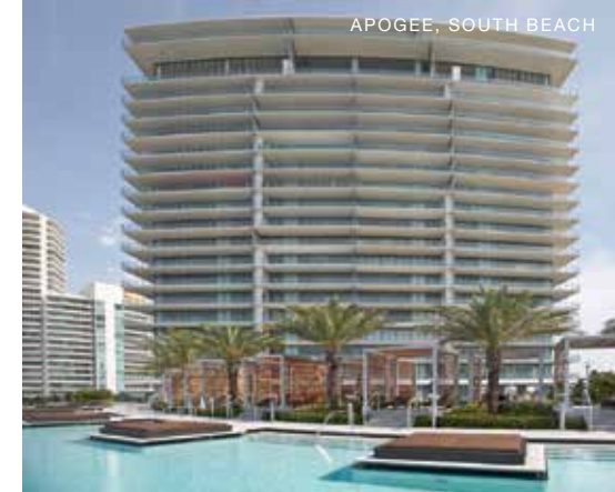
APOGEE, SOUTH BEACH