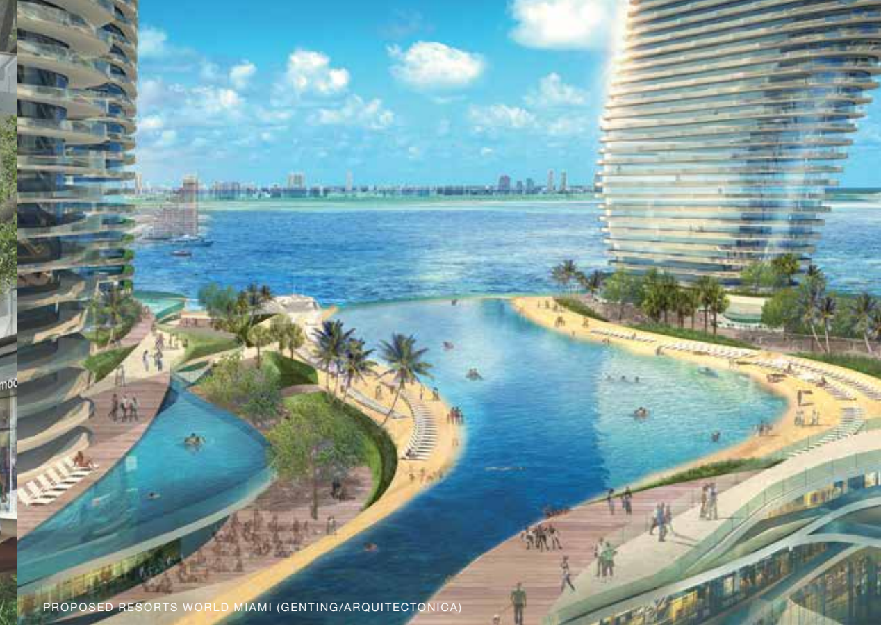
PROPOSED RESORTS WORLD MIAMI (GENTING/ARQUITECTONICA)