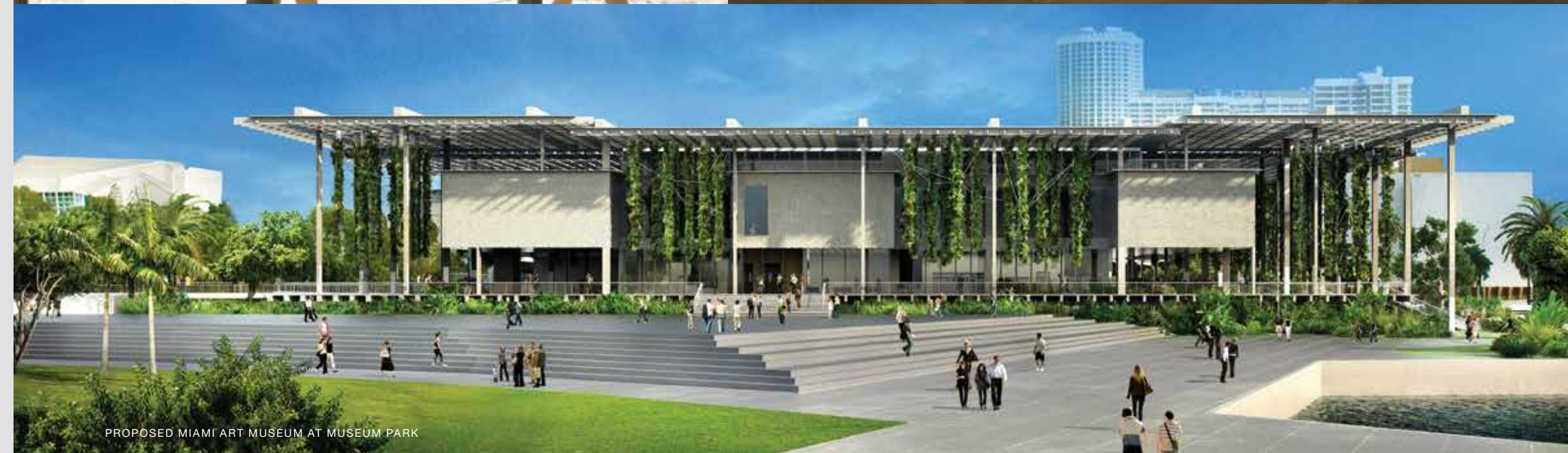
PROPOSED MIAMI ART MUSEUM AT MUSEUM PARK