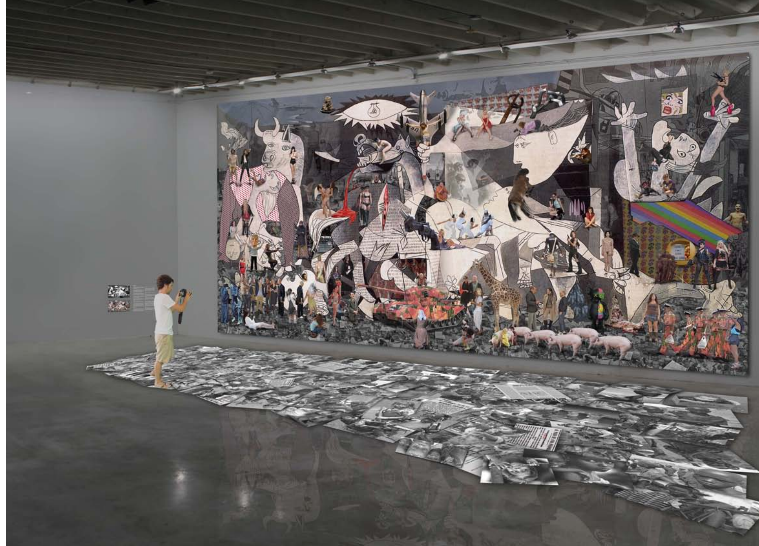
Lluís Barba Viajeros en el tiempo. Guernica. Picasso. 420 x 800 cm