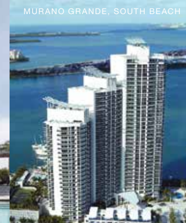
MURANO GRANDE, SOUTH BEACH