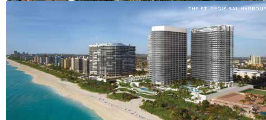
THE ST. REGIS BAL HARBOUR