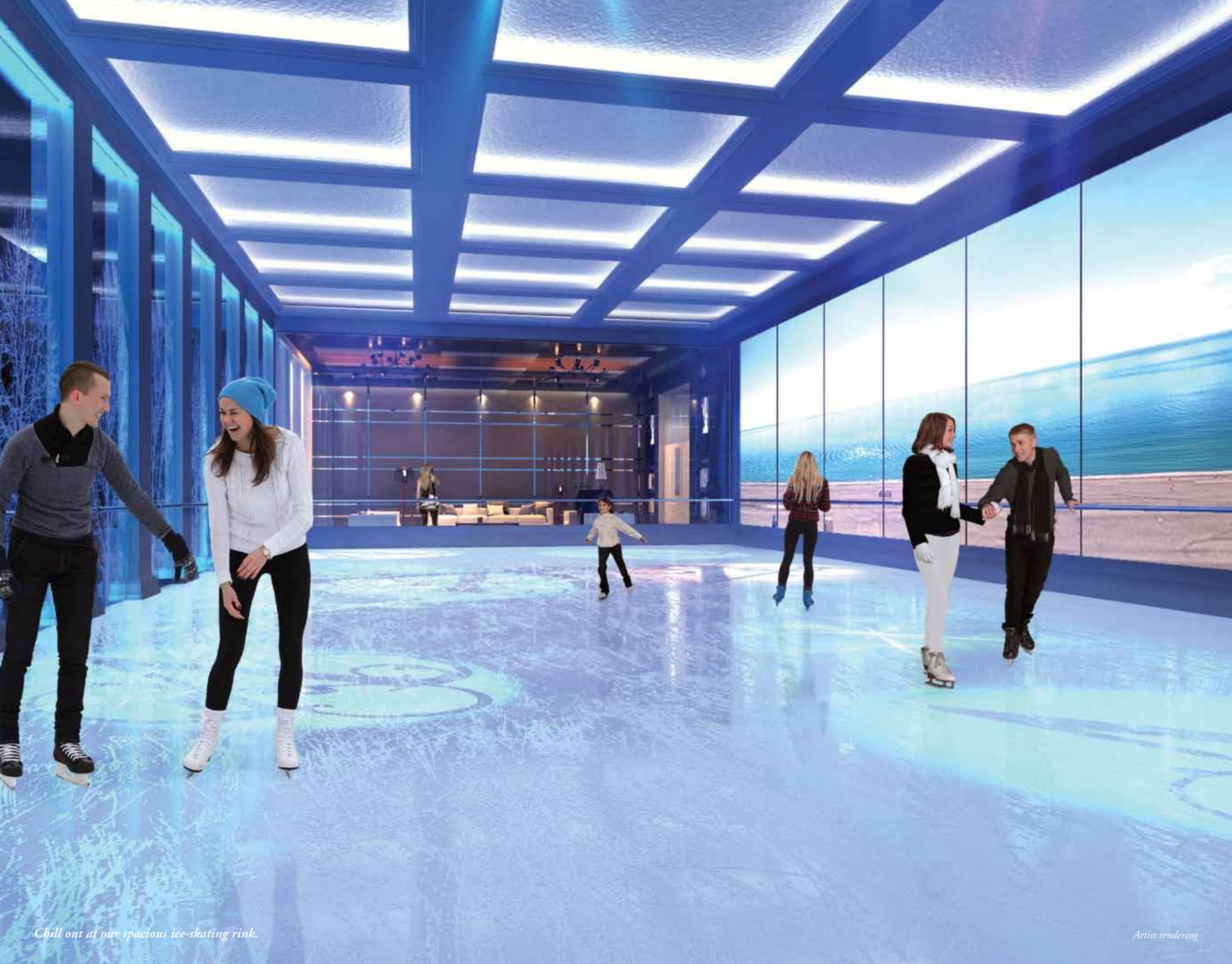
Chill out at our spacious ice-skating rink.