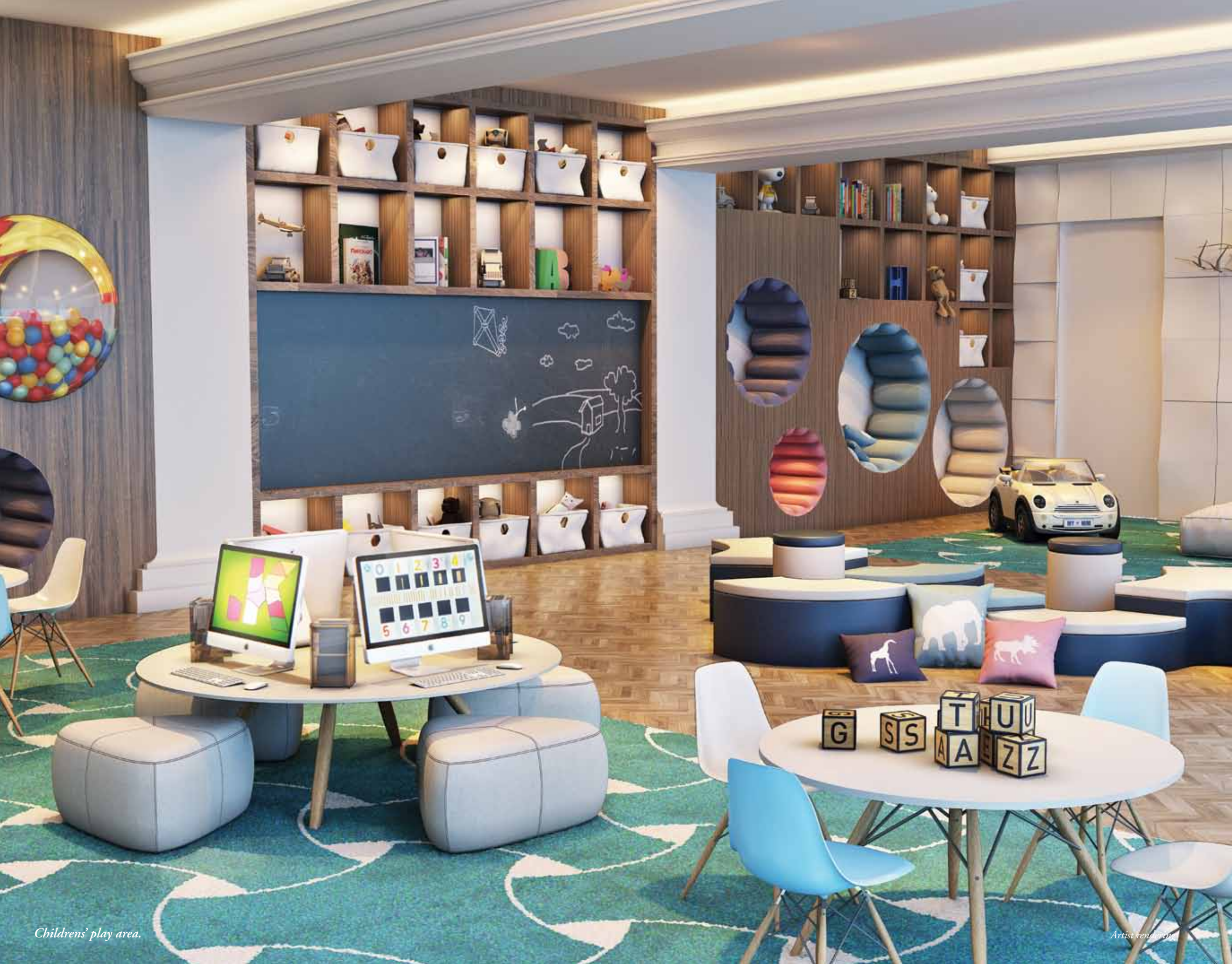
Children's play area.