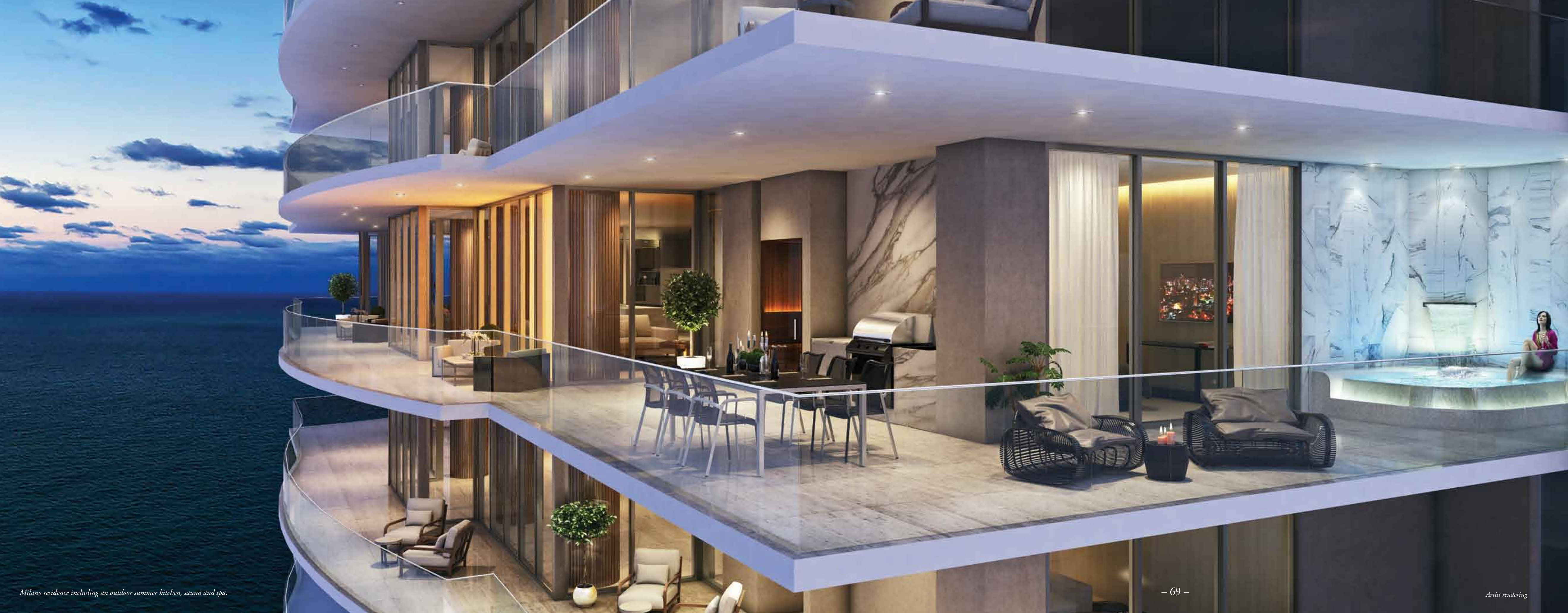
Milano residence including an outdoor summer kitchen, sauna and spa.