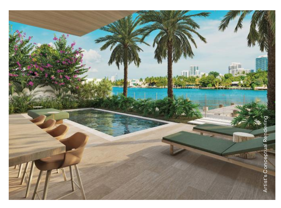
Residence Private Deck

Enjoy direct ocean access from the comfort of home with boat slips right at your door.