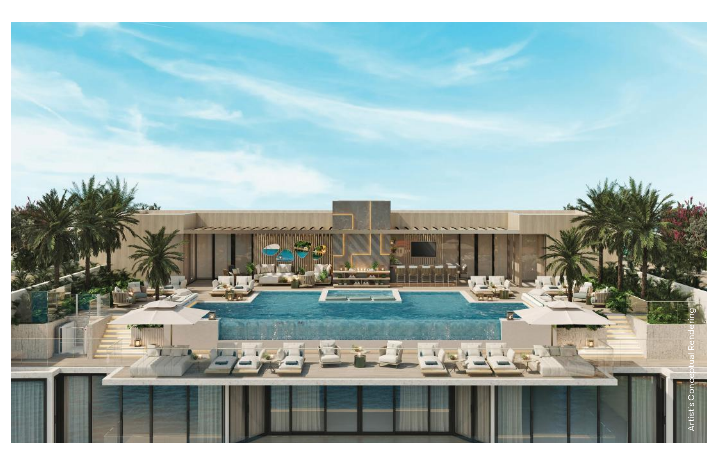
Regency Collection Rooftop