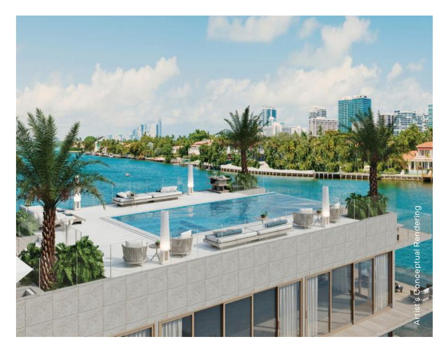
Signature Collection Rooftop

The large floor plans, surrounded by floor-to-ceiling glass exterior walls and terraces, feature a measured progression of rooms and spaces that feels luxurious and distinctive, with private and semi-private elevators that add to the feeling of retreat. The building is uniquely oriented on the island, facing east over the water to allow sunlight to move through the homes from sunrise to sunset as it travels along its southern axis and facilitates airflow throughout each residence.