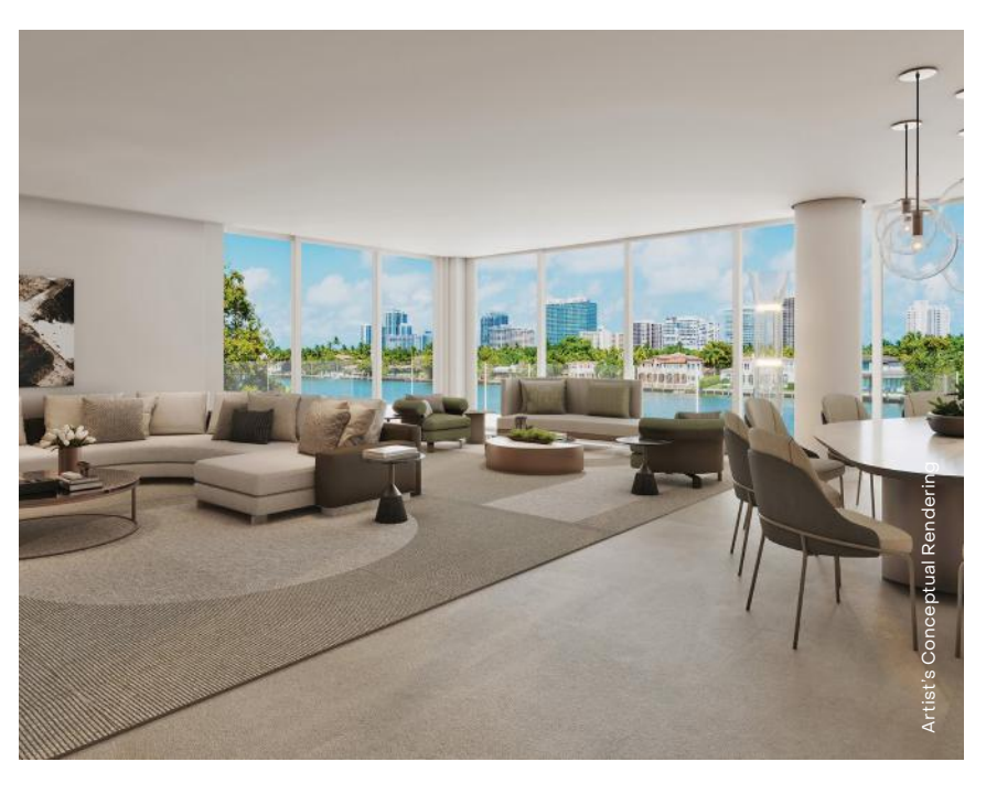
Residence Living Room

Enjoy direct ocean access from the comfort of home with boat slips right at your door.