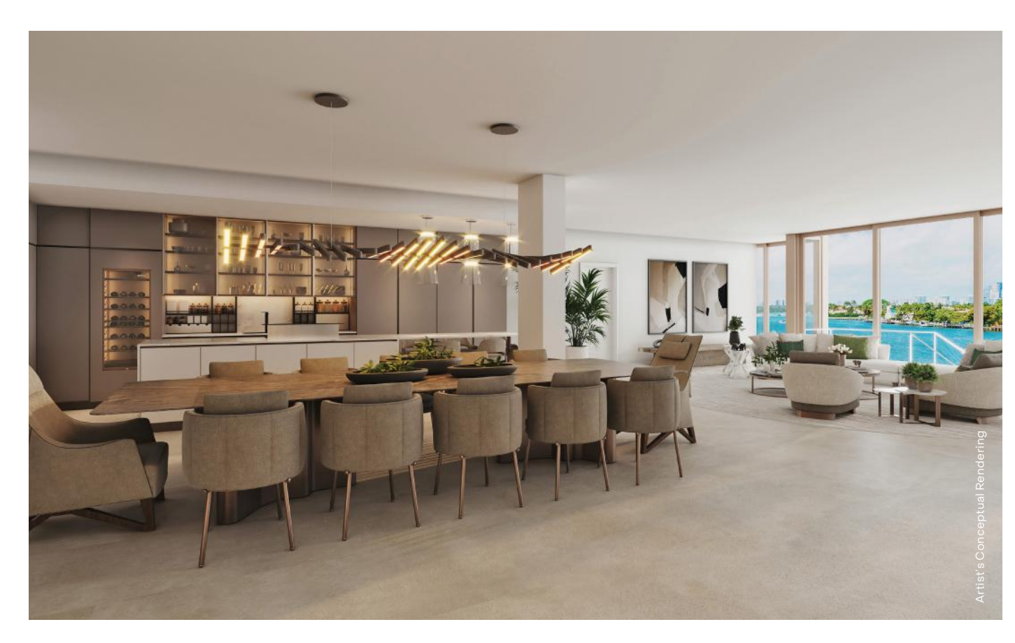
Residence Dining Room

Featuring wrap-around, floor-to-ceiling glass windows in every home, the architecture is inspired by a contemporary aesthetic, with streamlined features, tropical elements, and natural materials such as sand-colored stone, travertine, and bleached woods, creating a resort-like feel.