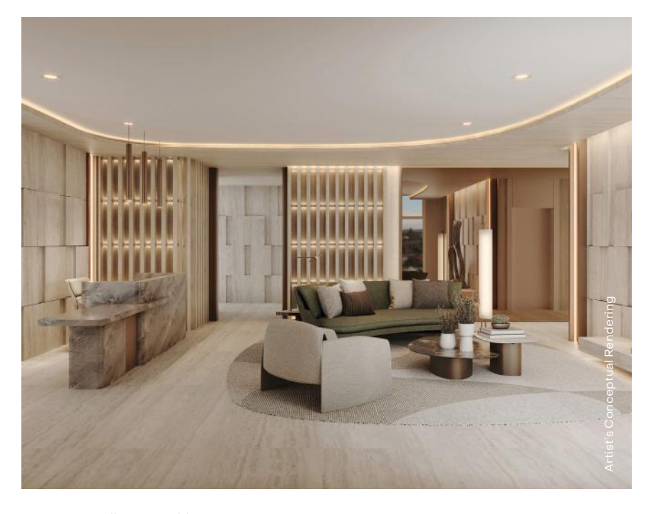
Signature Collection Lobby

Featuring wrap-around, floor-to-ceiling glass windows in every home, the architecture is inspired by a contemporary aesthetic, with streamlined features, tropical elements, and natural materials such as sand-colored stone, travertine, and bleached woods, creating a resort-like feel.