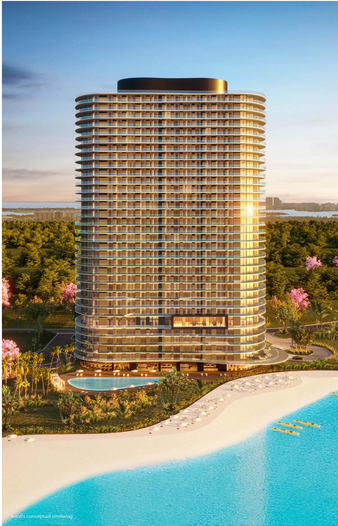
Artist's conceptual rendering