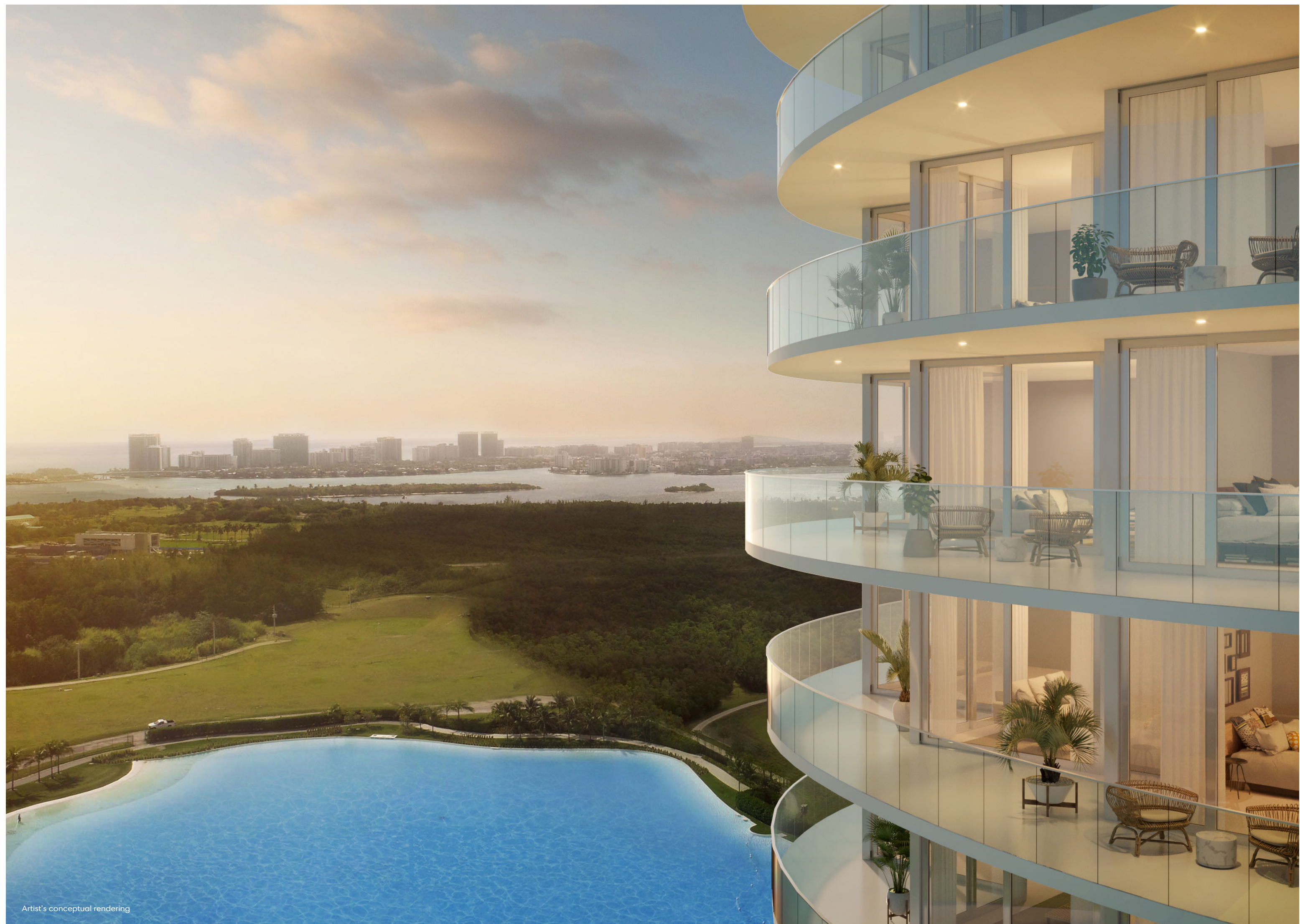
Artist's conceptual rendering