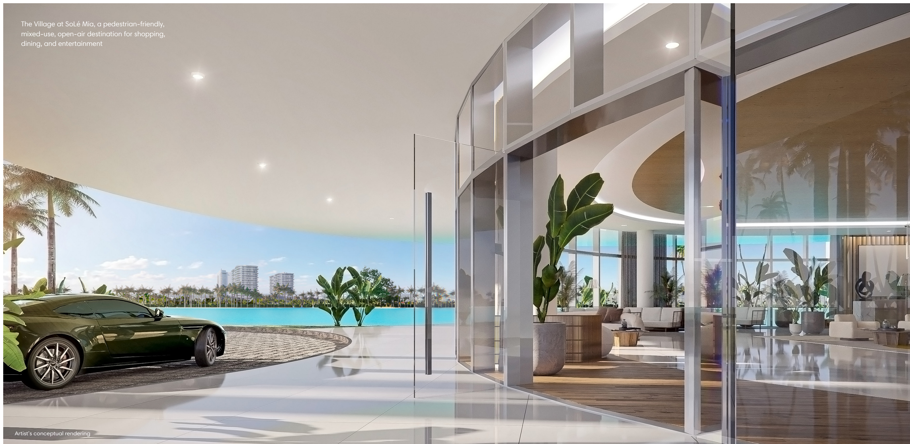
Artist's conceptual rendering

The Village at SoLé Mia, a pedestrian-friendly, mixed-use, open-air destination for shopping, dining, and entertainment