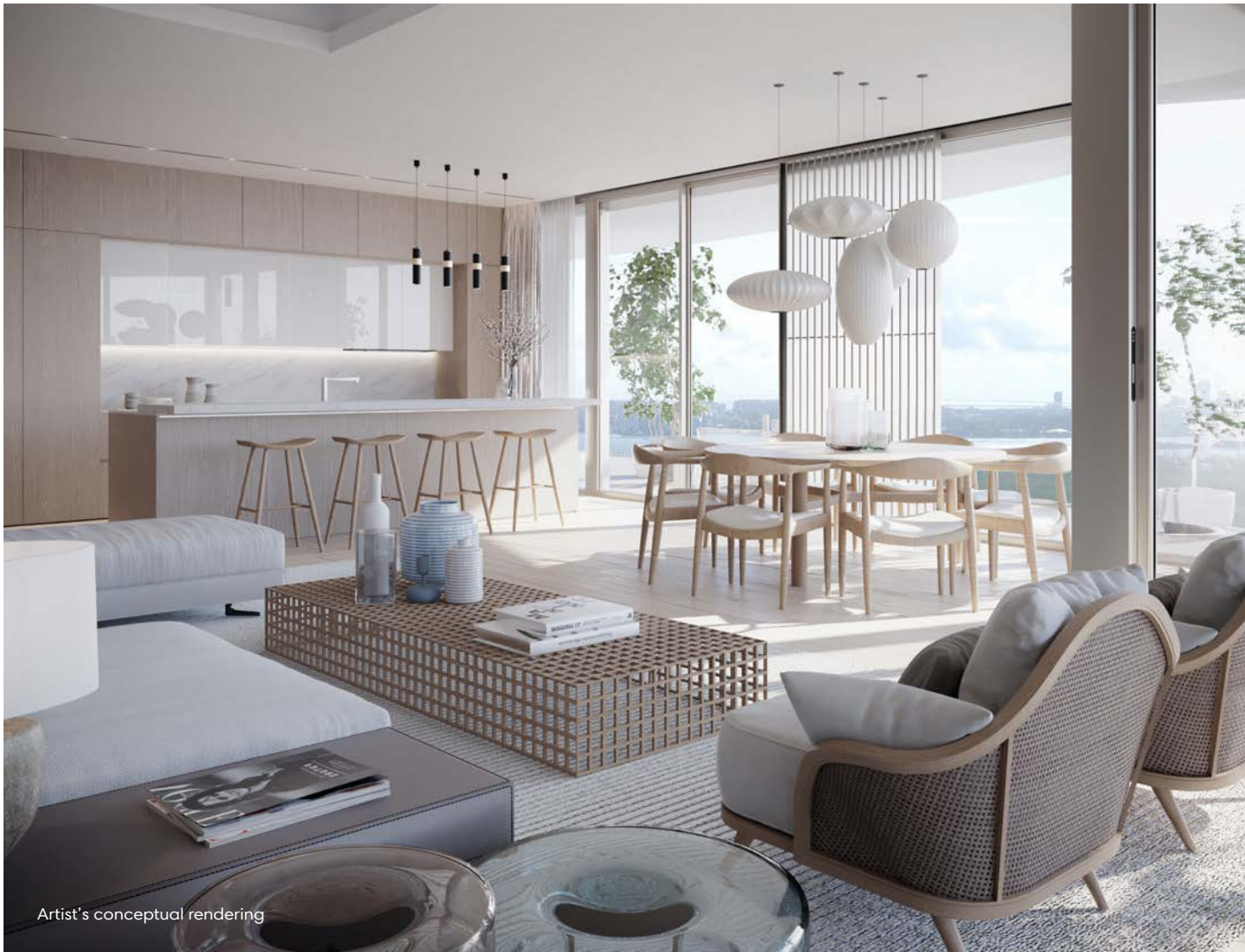
Artist's conceptual rendering