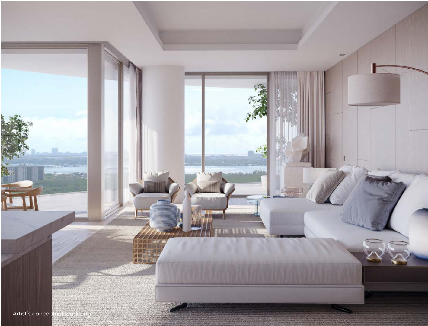
Artist's conceptual rendering