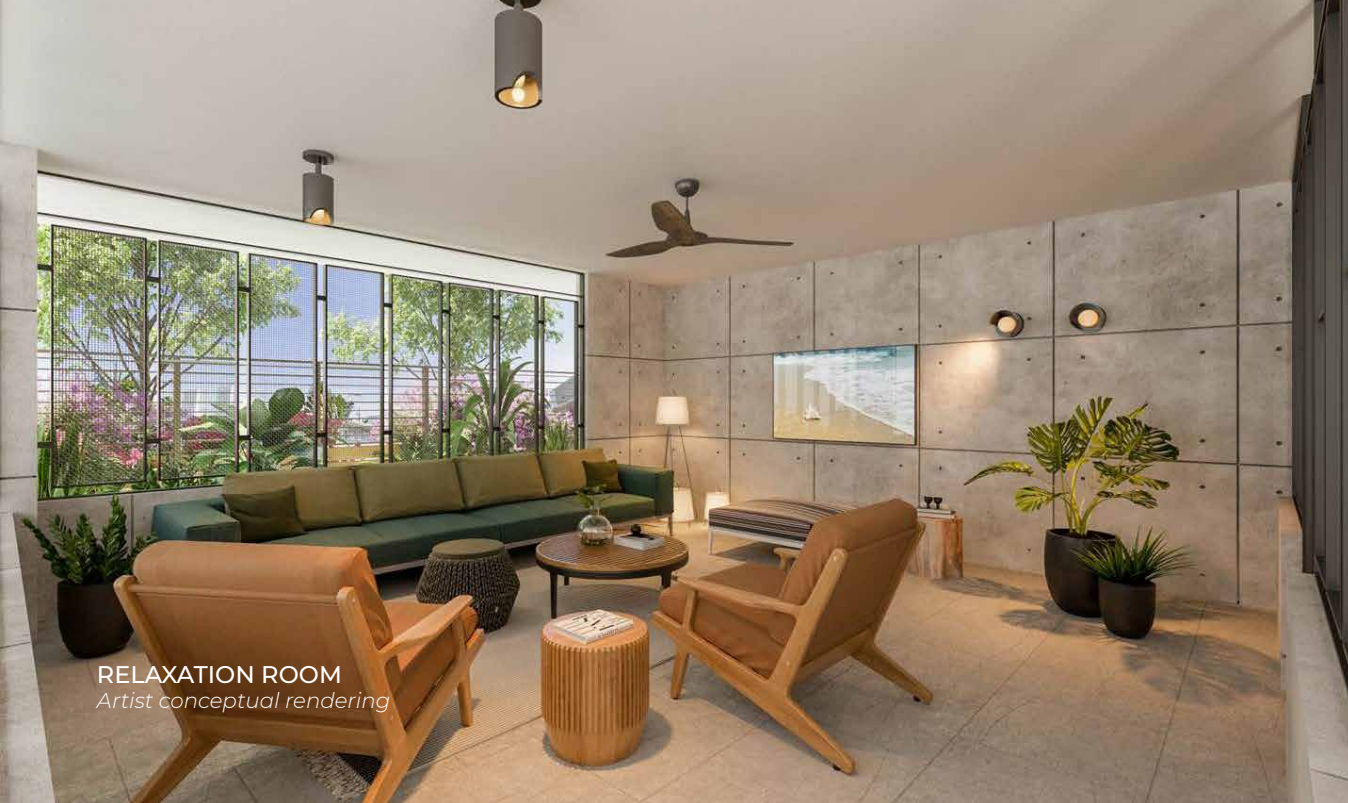
RELAXATION ROOM Artist conceptual rendering