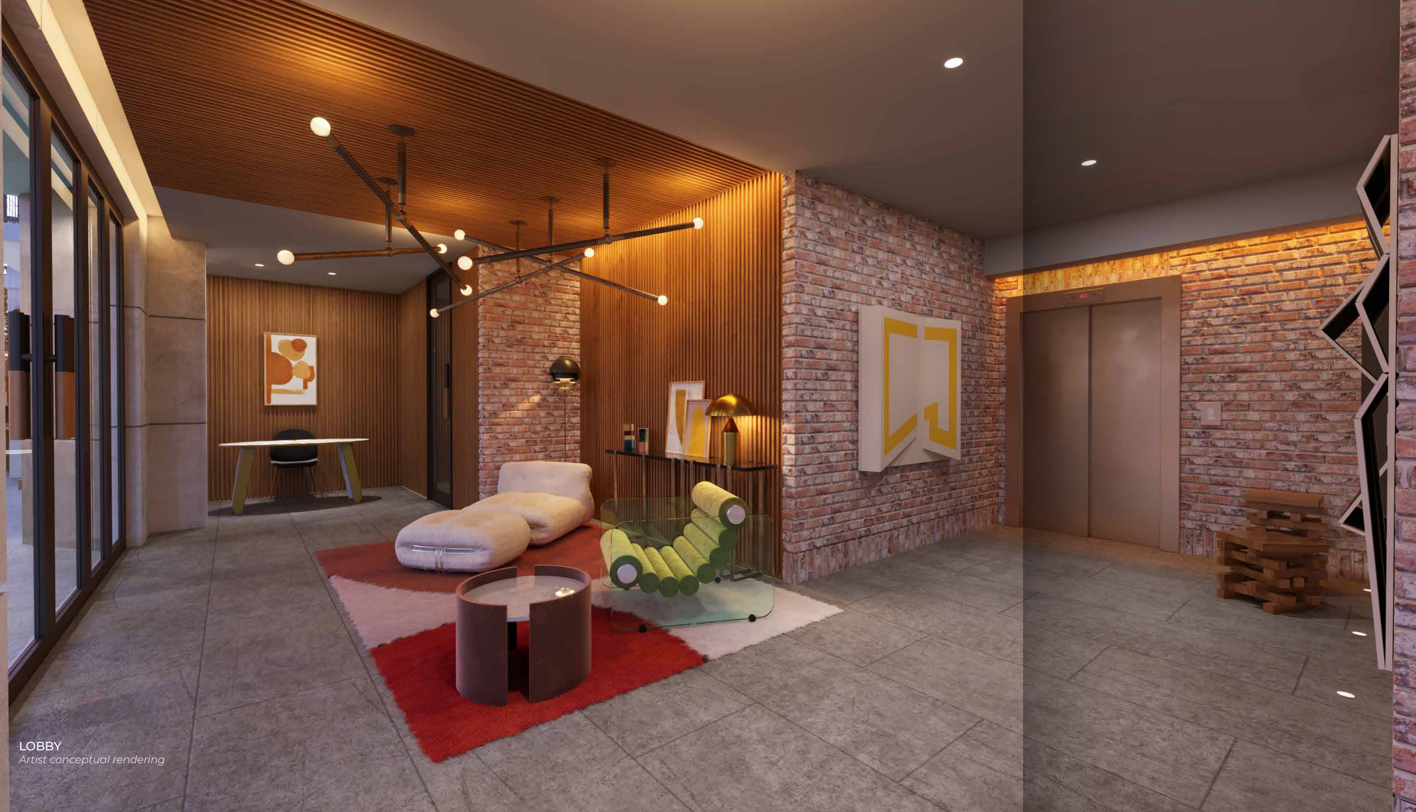
LOBBY Artist conceptual rendering

Come home to a relaxing environment and enjoy an exquisite art-curated lobby designed by Saladino Design Studios.