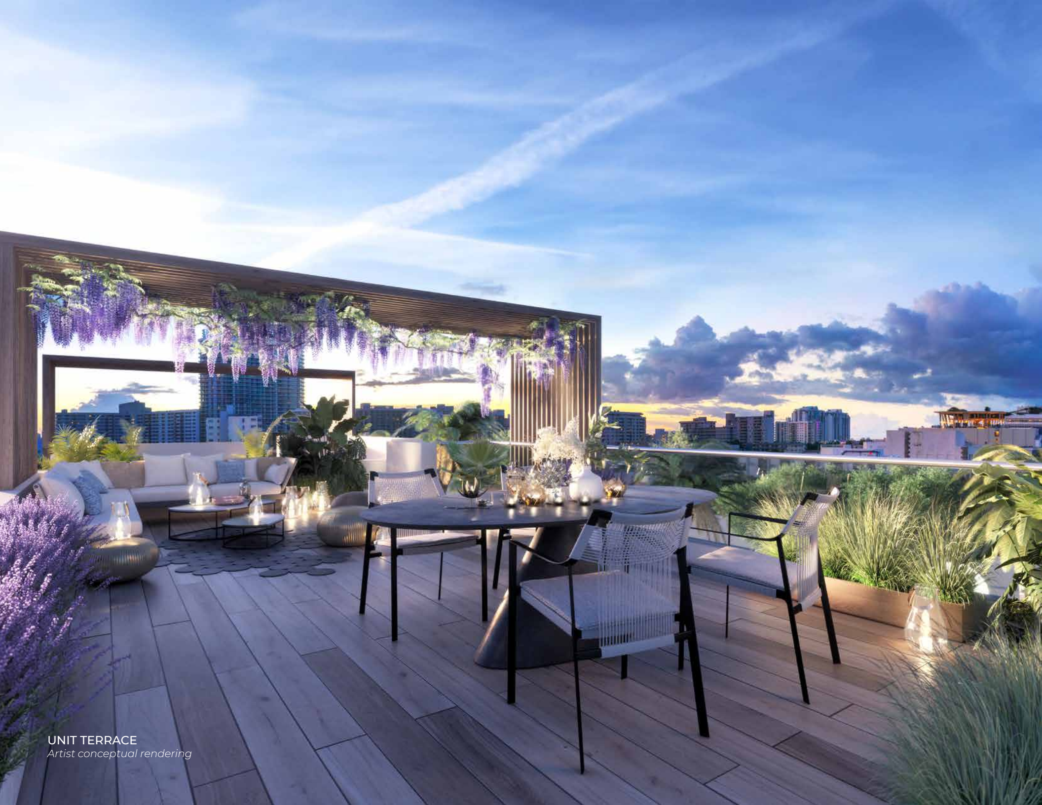
UNIT TERRACE Artist conceptual rendering