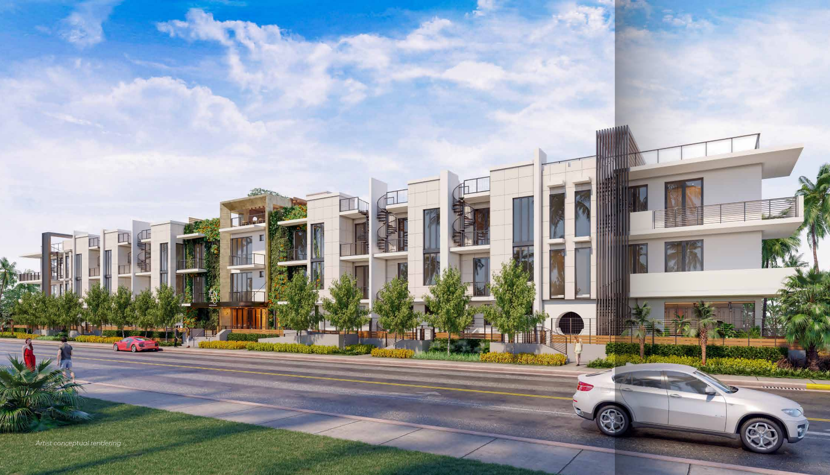
Artist conceptual rendering