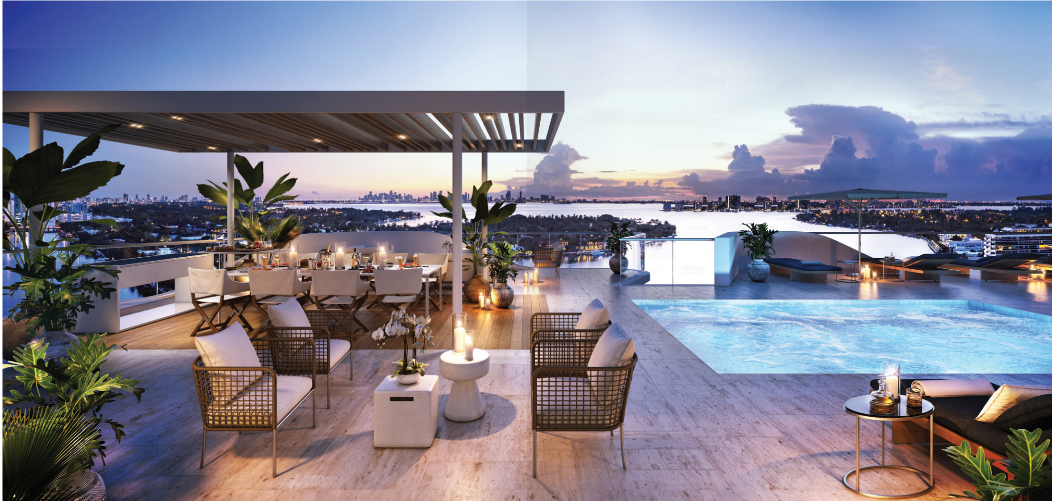
Rooftop pool, jacuzzi and sun deck with private lounging areas feature an outdoor grill and chef's table for entertaining.