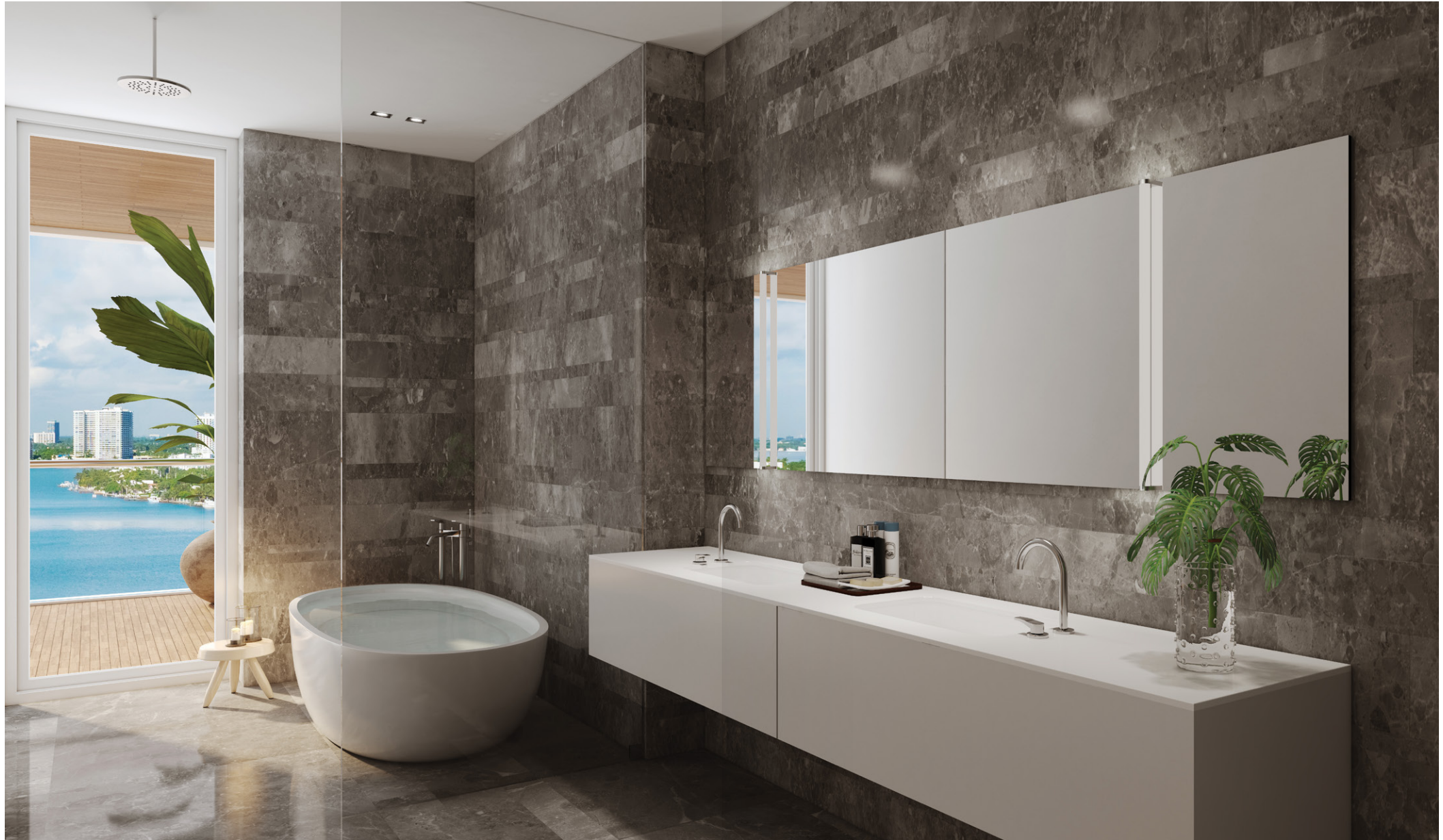
Deep soaking tubs, frame-less glass wet rooms, rain shower heads and imported marble flooring and walls bring quiet tranquility to master bathrooms.