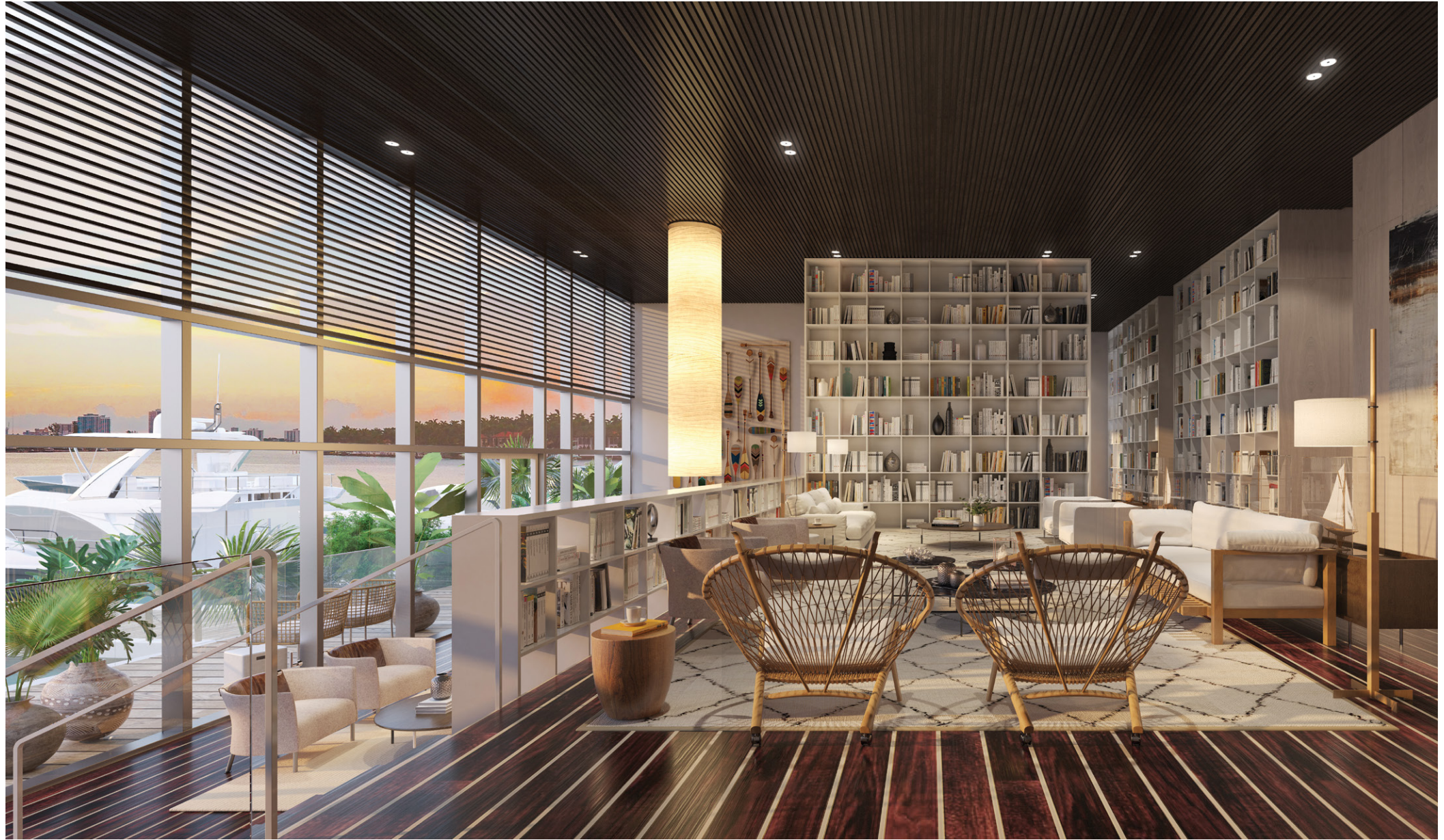
Floor-to-ceiling windows in the double-height lobby frame sweeping views of the Intracoastal and private marina.