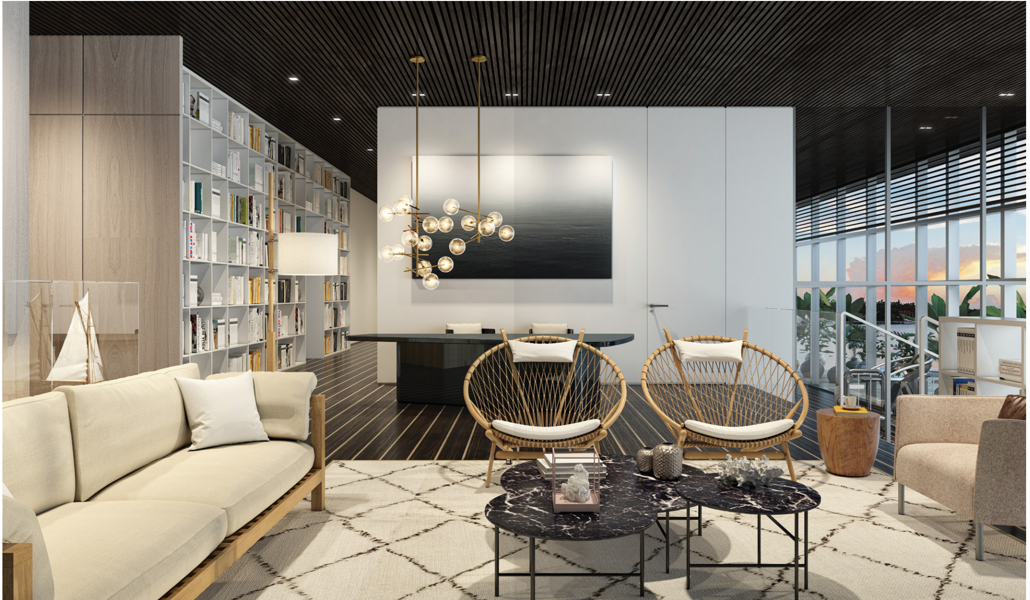
Côte d'Azur-inspired reception and lobby areas, curated by Lissoni®