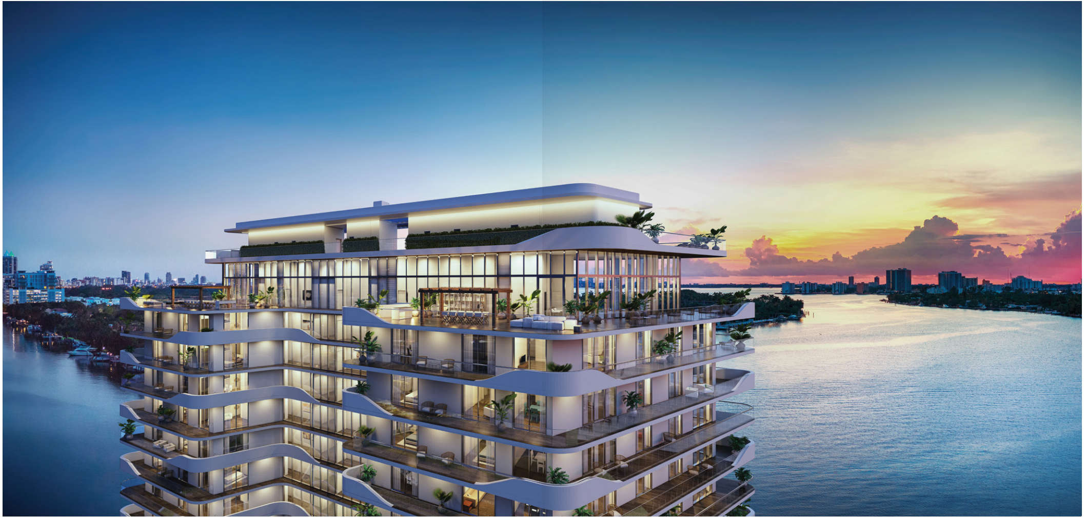
Two half-floor penthouses feature expansive wrap-around, rooftop terraces framing panoramic views of Biscayne Bay and the Atlantic Ocean.